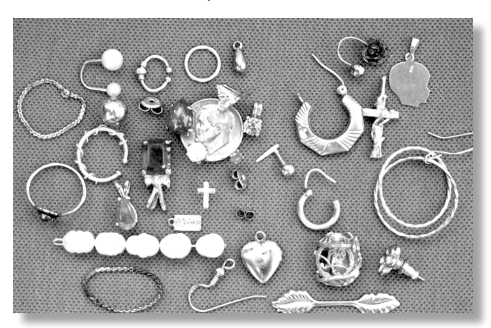
*notice all of the diamond earrings surrounding the dime