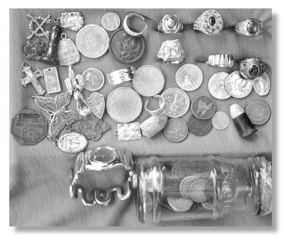
Above: Toms CZ-70 PRO finds - each read specifically as the new "Relic" 4th tone.

"I'm still surprised at the amount of deeper coins that produce an initial hit as "Relic."